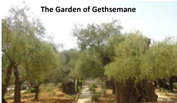
The Garden of Gethsemane