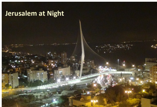
Jerusalem at Night

In 2012, we asked for your support for our Lights, Audio, and Film (L.A.F.) Project. We used those donations to purchase better quality filming equipment used to take more than 700 video clips and photos during the media mission to Israel in September 2012. Visit the website at: